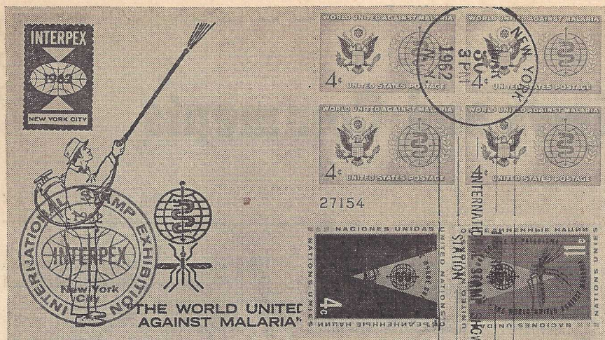
Cover postmarked March 30, 1962, at INTERPEX, New York City, franked with the anti-malaria stamps of the U.S. and U.N., first day of issue for both.

we are devoting our technical skills and financial resources to this greater effort. We are also vigorously supporting the worldwide leadership of the World Health Organization in the elimination of malaria, which involves also essential participation by allied agencies—the United Nations Children's Fund and the Pan American Health Organization.