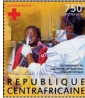
treating cerebral malaria

Design Size: 36 x 42 mm Margins: stamp designs extend through perforations Notes: singles from compound sheet Price: C