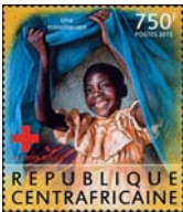
using mosquito net

Design Size: 36 x 42 mm Margins: stamp designs extend through perforations Notes: singles from compound sheet Price: C