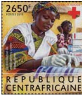
prescribing malaria medication

Design Size: 36 x 42 mm Margins: stamp designs extend through perforations Notes: single from souvenir sheet Price: C