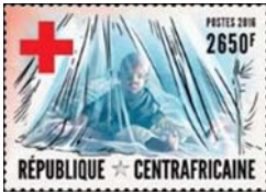
child under bed net

Notes: Single from souvenir sheet Price: C