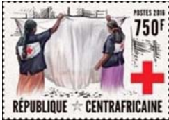
hanging bed net