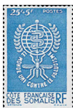
Somali Coast B15