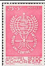
Comoro Islands B1