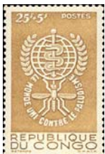
Congo Republic B3