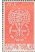
Upper Volta B1