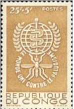
Congo Republic B3