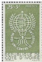
Ivory Coast B15