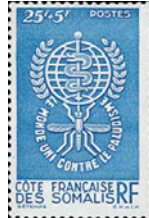
Somali Coast B15