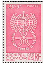
Comoro Islands B1