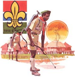
THE OFFICIAL WORLD SCOUT STAMP COLLECTION LA COLLECTION OFFICIELLE DE TIMBRES DU SCOUTISME

Type: GM-1 Producer: FM Size: 180 x 98 mm Notes: Boy Scouts engaged in mosquito control activities