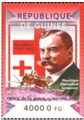
Sir Ronald Ross

Design Size: 34½ x 49½ mm Margins: design extends through perforations Sub-topics: mosquito Notes: single from souvenir sheet Price: C