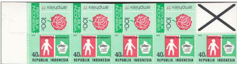
b 1013 on bottom

Description: strip of five 1013 printed se-tenant with strip of four 999 plus label; printed sheets affixed to cover material at selvage and cut horizontally; no evidence of horizontal perforations is seen at top and bottom of panes; horizontal cuts curve slightly upward from center to ends; cover has logo and BLOK PRANGKO