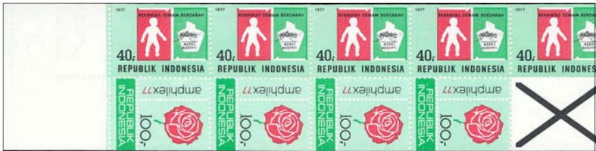
a 1013 on top

Checklist: unused ___ used ___ fdc ___ other ___