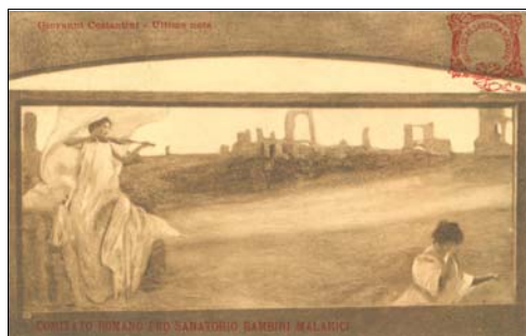
Image: fleeing a town in ruins