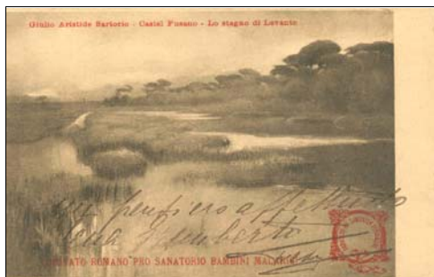
Image: swamp Text: Fusano Castle: The Levante Pond by Giulio Aristede Sartorio Notes: Price: E