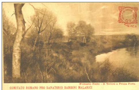
Image: stream Text: The Tiber at Prima Porta by Filiberto Petiti Notes: Price: E