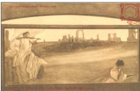
Image: fleeing a town in ruins Text: The Last Note by Giovanni Costantini Notes: cancelled Rome: January 13, 1912 Price: E