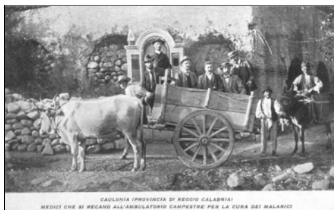
CAULONIA (PROVINCIA DI REGGIO CALABRIA) MEDICI CHE SI RECANO ALL'AMBULATORIO CARPESTRE PER LA CURA DEI MALARICI

Image: doctors in wagon Text: Doctors who go to the rural clinic for the treatment of malaria Notes: Price: E