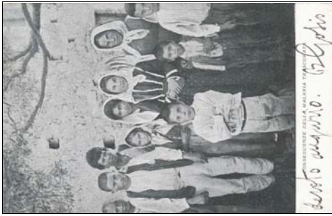
Image: family group Text: Consequences of malaria neglected Notes: used: Rome: July 25, 1916 Price: E