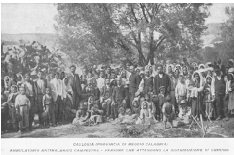
CAULONIA (PROVINCIA DI REGGIO CALABRIA) AMBULATORIO ANTIMALARICO CAMPESINE - PERSONE CHE ATTENDONO LA DISTRIBUZIONE DI CHININO

Image: people seeking quinine pills Text: Outpatient clinic in antimalarial country - People who are waiting for the distribution of quinine Notes: Price: E