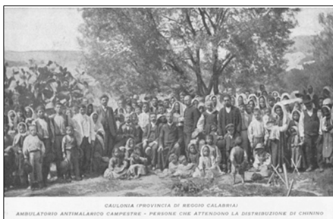
CAULONIA (PROVINCIA DI REGGIO CALABRIA) AMBULATORIO ANTIMALARICO CARPESTRE - PERSONE CHE ATTENDONO LA DISTRIBUZIONE DI CHININO

Image: people seeking quinine pills Text: Outpatient clinic in antimalarial country - People who are waiting for the distribution of quinine Notes: Price: E