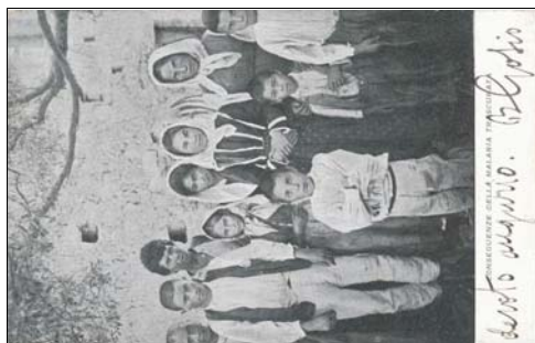
Image: family group Text: Consequences of malaria neglected Notes: used: Rome: July 25, 1916 Price: E