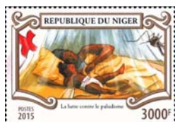
mother and child under bed net

Design Size: 48 x 33 mm Margins: clear Sub-topics: mosquito Notes: single from souvenir sheet Price: C