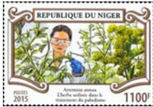
researching Artemisia annua