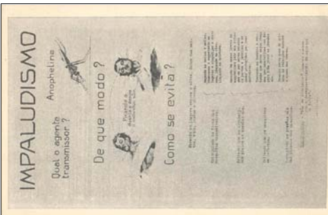
Image: mosquito and malaria patients Text: simple description of malaria transmission and how to avoid and treat the ailment