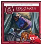
using bed net