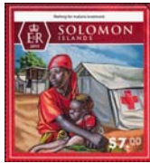
waiting for treatment

Design Size: 47 x 52 mm Margins: portion of sheet background; a and b have portion of stamp design Notes: singles from compound sheet Price: B